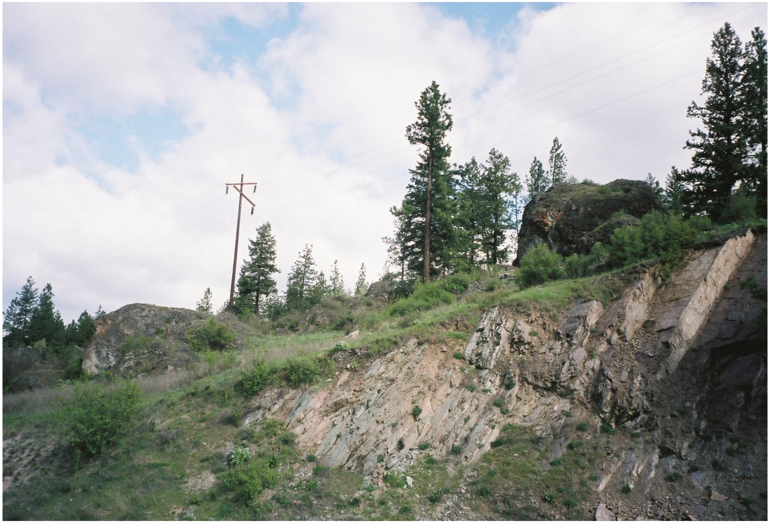
Above the water ripple strata the whole area is strewn with these glacier boulders