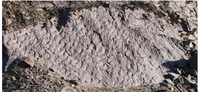
ALBERTON GORGE WATER RIPPLE ROCKS