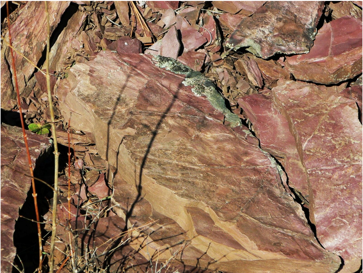
ALBERTON GORGE WATER RIPPLE ROCKS